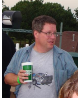
One of the DOT ‘ playas ’