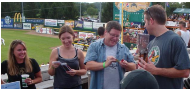
Checking those raffle numbers!! Great Prizes!!