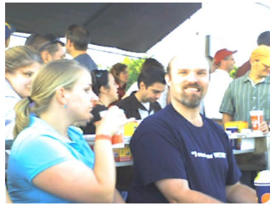
Enjoying summertime in Wisconsin.